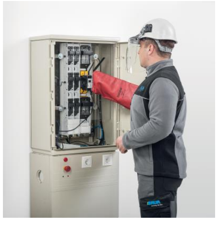
LV-Guard fitted in fuse cabinet

Arno Gozzi Raiffeisenstrasse 8 6832 Sulz (Austria) Tel.: +43 (0)5522 4941-55 a.gozzi@baur.at www.baur.eu