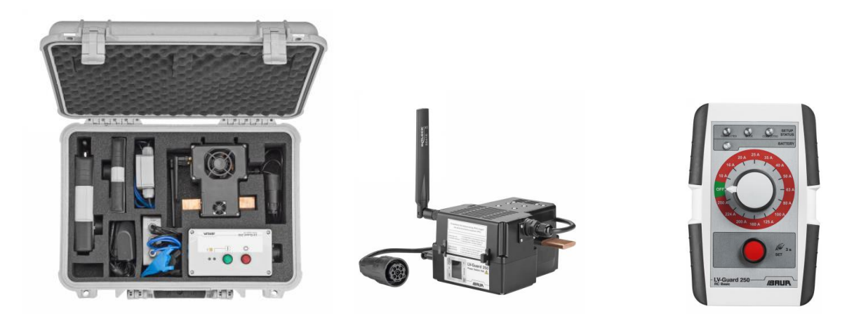
The LV-Guard 250 system includes an intelligent power switch, a safety power supply unit and various version-dependent remote controls.