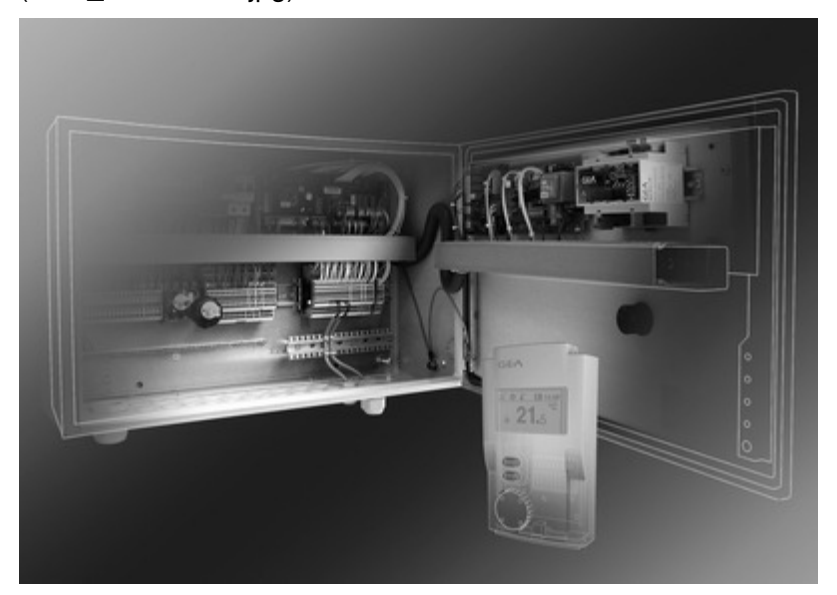
The GEA MATRIX 400x control system for ventilation units with outdoor-air connection, as well as the GEA MATRIX 4700 (see image) for compact and central air-handling units, include control functions for assuring air quality.